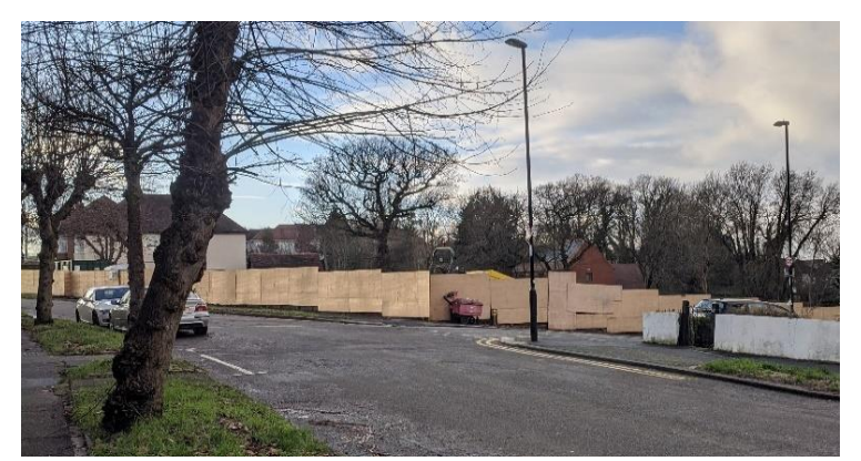
What is going on?

The PHRA committee asked me to write a piece on 66 Pollards Hill North, the Old Vicarage, now that site works have commenced and many of you will be wondering, what is going on.