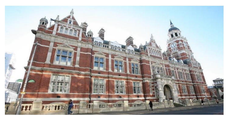
Croydon Town Hall where councillors make the decisions on local planning matters.

The vote to demolish the beautiful Old Vicarage got waived through under the "previous administration" controlled planning committee. This included our very own ward councillor, her stated preference was, that an intensification of the site, with more social housing was the preferred option. She abstained at the vote and this, coupled with her colleague and chair of the committee, exercising his right to use the casting vote, sealed the decision. On the 6th of December 2022 saw a sad day for Pollards Hill as the Old Vicarage was bulldozed.