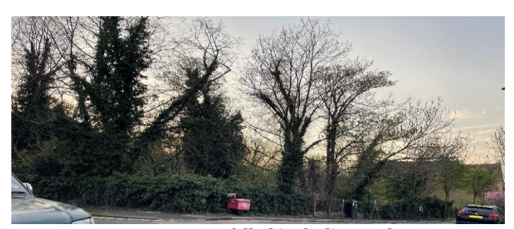
Over 50 trees felled including Oaks.

The woodland to the rear was briefly used as a school playground circa 1930 with many mature trees including oaks contained within the boundaries. The land was also used as an allotment during WW2 and later used for church summer fetes. The site also provided a rich environment for nesting birds, bats, Foxes, badgers etc. The Council's Development and Environmental department in 2014 recognised that the site was within an area of archaeological significance and archaeological potential.