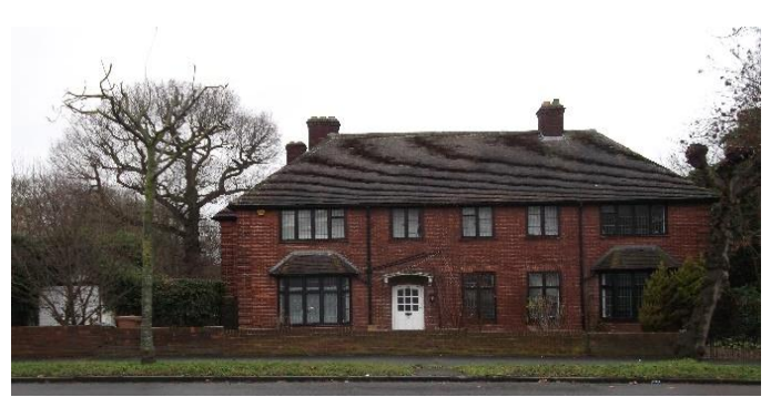
The much beloved Old Vicarage

Rest assured, I have already watched the webcast and advise you not to waste your time, just skip past the waffle and cut to the pertinent section by scrolling to 58:42 mins of the webcast.