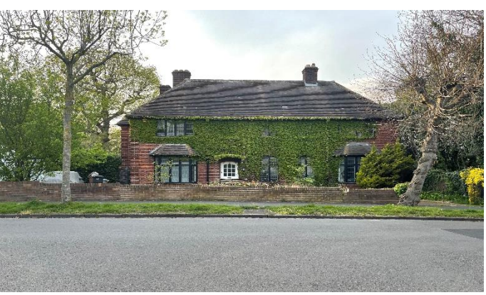
just before its demise

The new scheme is for the erection of 9 houses on the site with one detached and four pairs of semi-detached dwellings designed to be modern, contemporary and introduce a new character to the Pollards Hill area. The dwellings have been designed to accommodate one parking space per plot, which will most likely cause vehicular overspill and increase parking stress on Pollards Hill. Bizarrely it was mooted during the planning committee meeting that no off-street parking would have been preferred, this will no doubt boggle your mind. Love it or hate it? This is now the fullback position for the site, and it is worth noting that until the construction of the scheme has been completed, there is a potential for further planning applications to come forward, however this is unlikely.